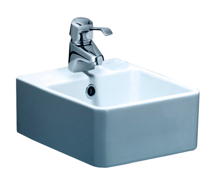
Tapware shown for photographic purposes only

Offering a wide range of basins with strong square angles, slim walls and softened edges, Cube is a striking design option for the modern bathroom. While the Cube wall basin blends the sharpest contemporary looks with a welcoming feel, it provides a medium-sized bowl area and a distinctive tapware platform. The basin is suitable for domestic, commercial and accessible applications & complying to AS 1428.1-2009 Amd. 1 using standard Caroma plastic traps.*